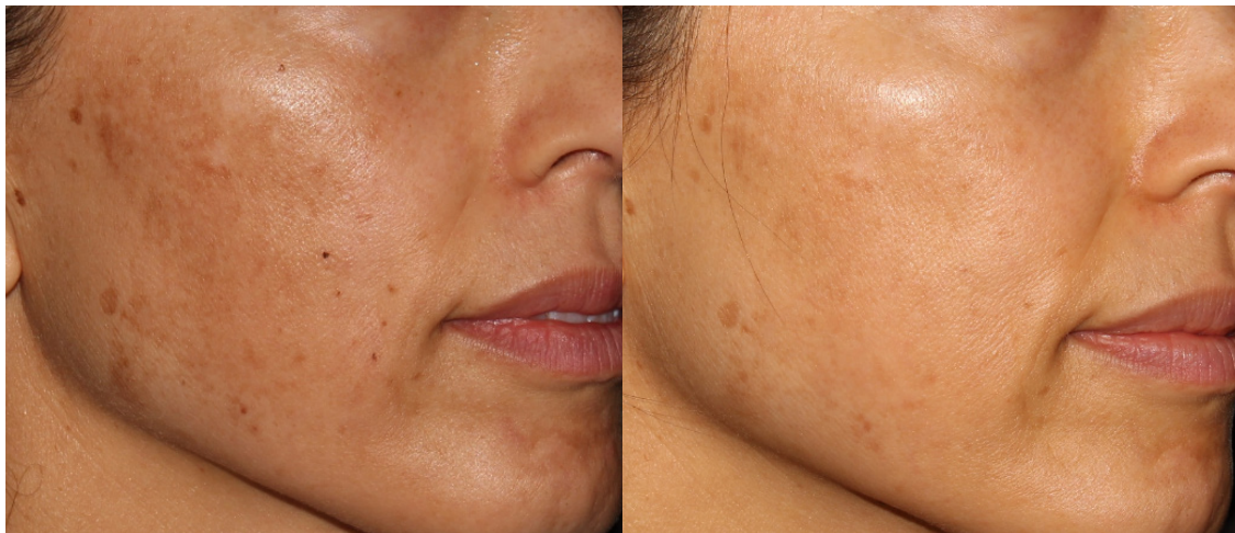
BBL HERO | Post 3tx | 650 Pulses to Cheek