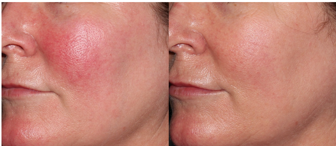
BBL HERO | Post 3 tx | 1250 Pulses to Face | Courtesy of Patrick Bitter, Jr., MD, FAAD